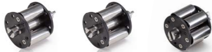
Three rollers Standard using