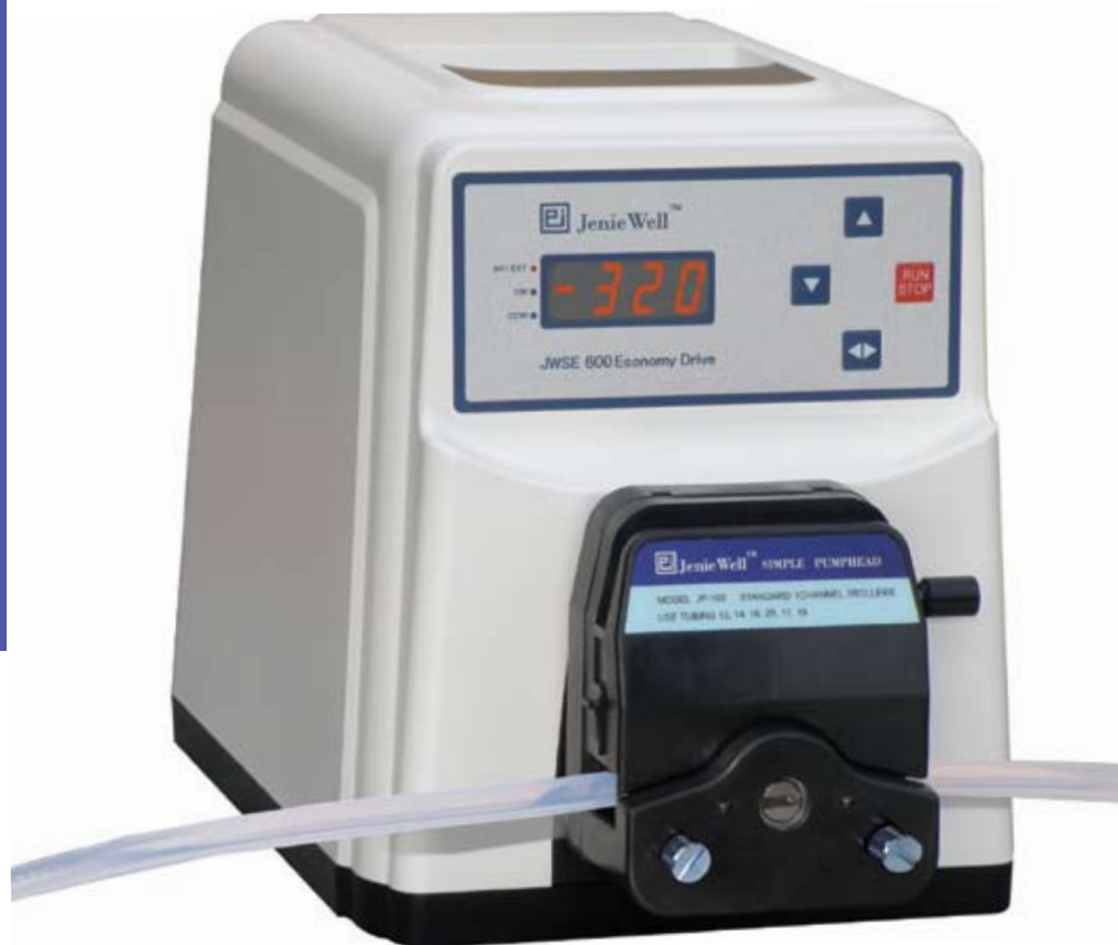
MODEL N o. JWSE 100, JWSE6 00